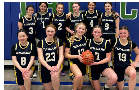
SR GIRLS ARE REGIONALS BOUND THIS WEEKEND!