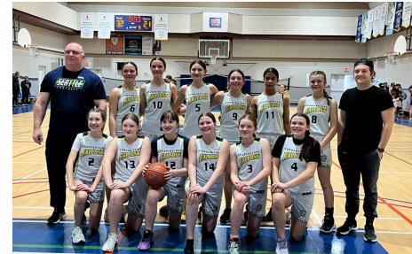
A GIRLS PLAY IN THE CITY FINALS TONIGHT!