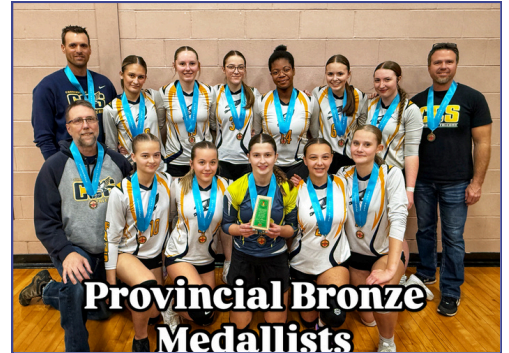
Provincial Bronze Medallists

4:30-6:00pm- HS Girls Bball Practice @ CCS