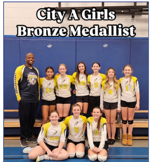
City A Girls Bronze Medallist