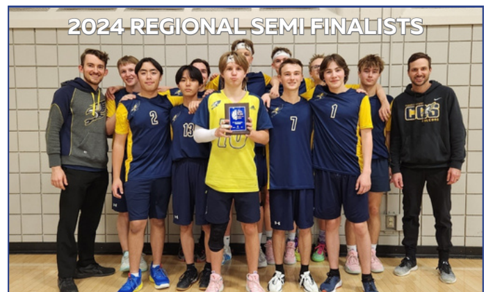
2024 REGIONAL SEMI FINALISTS

Participating in a team can improve cognitive function, as collaboration sparks creative problem-solving. It also boosts emotional intelligence, teaching empathy and conflict resolution. Studies show team sports can enhance brain plasticity, helping with memory and focus. Interestingly, being part of a team also strengthens resilience and adaptability in stressful situations.